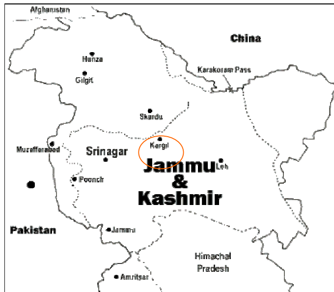
Figure 2: Location of Kargil District in Jammu & Kashmir

Kargil District, where Chutak Project is located, within Jammu & Kashmir State can be seen in Figure 2.